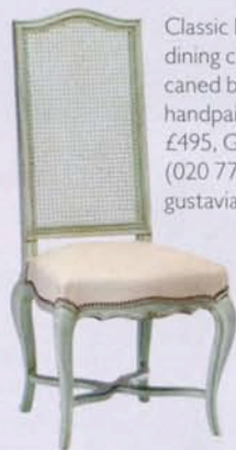
Classic Louis XV dining chair with caned back and handpainted finish, £495, Gustavian (020 7724 6444, gustavian.com ).