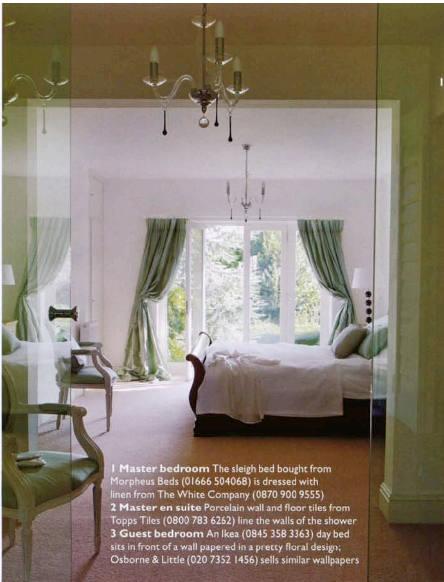
1 Master bedroom The sleigh bed bought from Morpheus Beds (01666 504068) is dressed with linen from The White Company (0870 900 9555) 2 Master en suite Porcelain wall and floor tiles from Topps Tiles (0800 783 6262) line the walls of the shower 3 Guest bedroom An Ikea (0845 358 3363) day bed sits in front of a wall papered in a pretty floral design; Osborne & Little (020 7352 1456) sells similar wallpapers