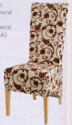
Floral dining chair, available in Black, Brown or Cream, £152.75, QVC (0800 504030, qvcuk.com ).