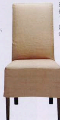
Berkeley dining chair, from £475, The General Trading Company (020 7730 0411, generaltradingcompany.co.uk ).