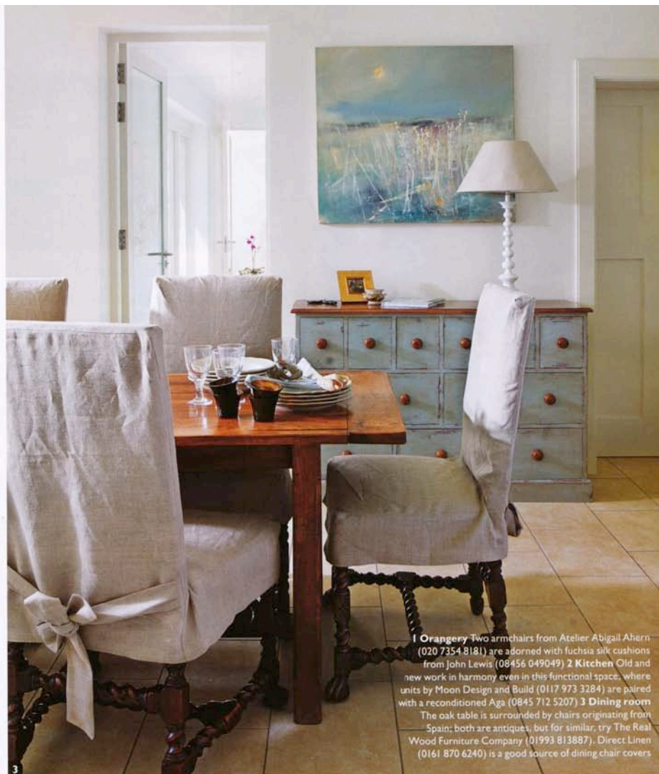
1 Orangery Two armchairs from Atelier Abigail Ahern (020 7354 8181) are adorned with fuchsia silk cushions from John Lewis (08456 049049) 2 Kitchen Old and new work in harmony even in this functional space, where units by Moon Design and Build (0117 973 3284) are paired with a reconditioned Aga (0845 712 5207) 3 Dining room The oak table is surrounded by chairs originating from Spain; both are antiques, but for similar, try The Real Wood Furniture Company (01993 813887). Direct Linen (0161 870 6240) is a good source of dining chair covers